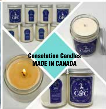
Consolation Candles MADE IN CANADA